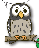
Park Symbol: Owl

Click here for events and seasonal information