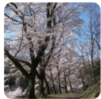
Yoshino cherry (Sakura-no-Michi)