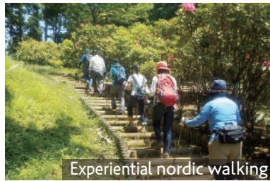
Experiential nordic walking