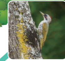
Japanese green woodpecker