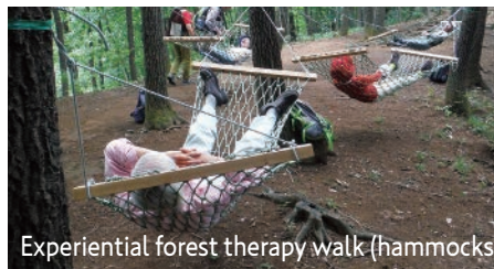
Experiential forest therapy walk (hammocks)